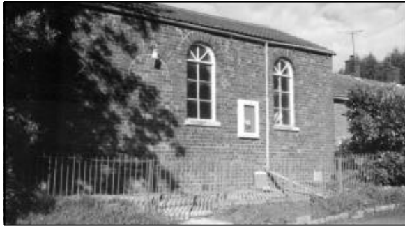
Claxby Village Hall

The following year West Lindsey District Council bought the building to turn it into a hostel using grants from the Silver Jubilee appeal. It was renovated and in 1981 when further money was available it was equipped with sleeping and cooking facilities so that it could be used for study groups during the week and youngsters at the weekends. Bookings were disappointing although in 1983 a German