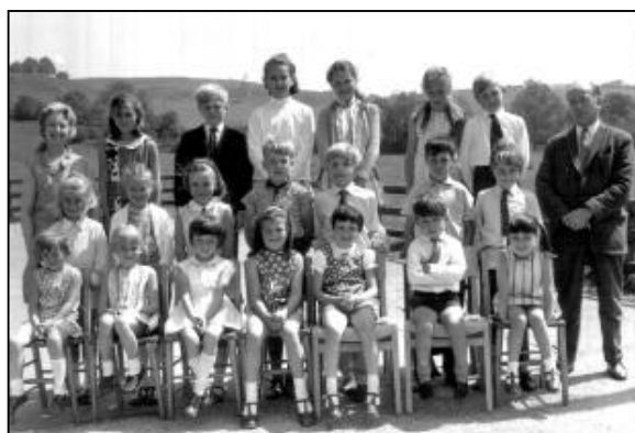
Claxby School 1970

The school started to come under threat of closure in 1946 when it was listed as being due for closing. The managers and Parish Council mounted a strong resistance campaign. This was the first evidence of any resistance to authority and it was successful in the short term. It probably caused the headmistress to leave prematurely. As soon as the school was listed she applied for another job in the