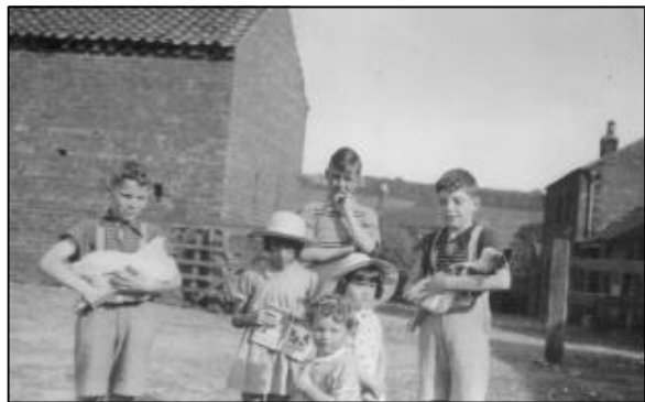
Evacuees at Maultby's Farmhouse