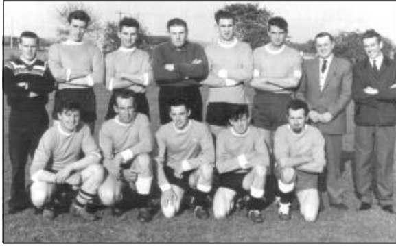
Innes Cup Winners 1966