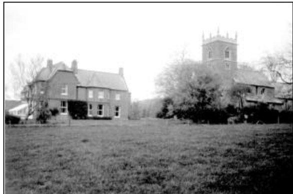
Claxby Rectory and Church after 1871

“Once a year we were transported by waggon and horses to the Service ‘Matron’s Meeting’ in the Caistor Church followed by sports.”