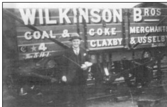
One of Wilkinson's railway wagons

Bicycles may have been important for personal use but horses remained the prime means of moving goods locally at least until the late 1920s. They were used in close relationship with the railways which hauled most goods long-distance. At Claxby station from 1868 Wilkinson Brothers ran a coal haulage business. They had their own railway wagons coming into sidings at Claxby from where they hauled to consumers by horse wagon. Wilkinsons bought their first lorry, a second hand thirty hundredweight FIAT between 1919 and 1921. They sold their business in