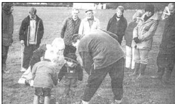
Millennium Tree Planting Ceremony

Finally, to mark the millennium the village held a tree planting ceremony in the playing field in December 1999 when the village Millennium oak and five old Lincolnshire fruit trees were planted. In addition two local landowners agreed to plant a number of native trees in the hedgerows. Some residents joined with Normanby le Wold for a bonfire on the playing field on New Year's Eve, an echo of the close links between the two villages over the previous two hundred years or more. At the request of the majority of the village Claxby's own party was held over until the summer of 2000 when a roast pig supper and party was held at Lysaghts Social Club.