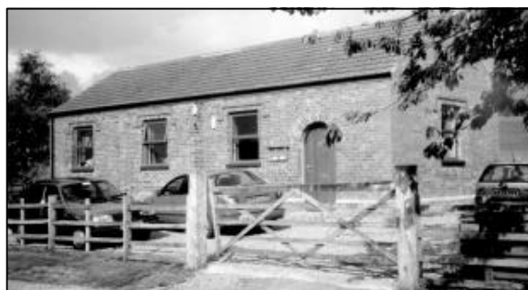
The Viking Centre after modernisation

After the school closed in 1971 the village decided that an attempt should be made to acquire it for use as a village hall. The schoolroom had been regularly used for many village