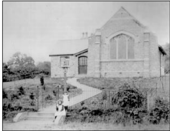
The New Wesleyan Chapel