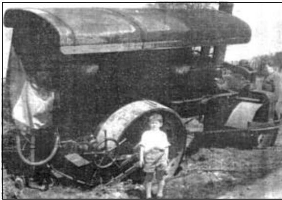
Ditched steam roller