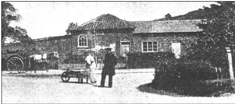
Wesleyan Methodist Chapel circa 1900

In 1900 the total population of the village was about 235, having fallen from 357 when the mine was in production. It continued to dwindle until 1971 when it fell to just 145, before making a modest recovery. The village looked different. The street layout was the same as it is today but there were big greens at the corner of Mulberry Road and Normanby Rise and at the Pelham Road/ St Mary's Lane junction. At this latter junction stood the original Wesleyan