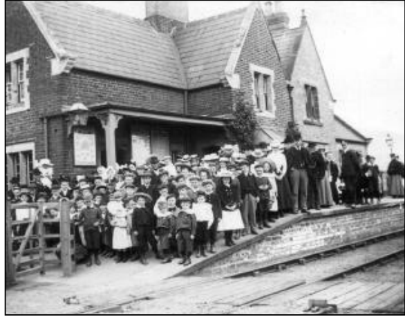
Osgodby School Outing at Claxby and Usselby Station