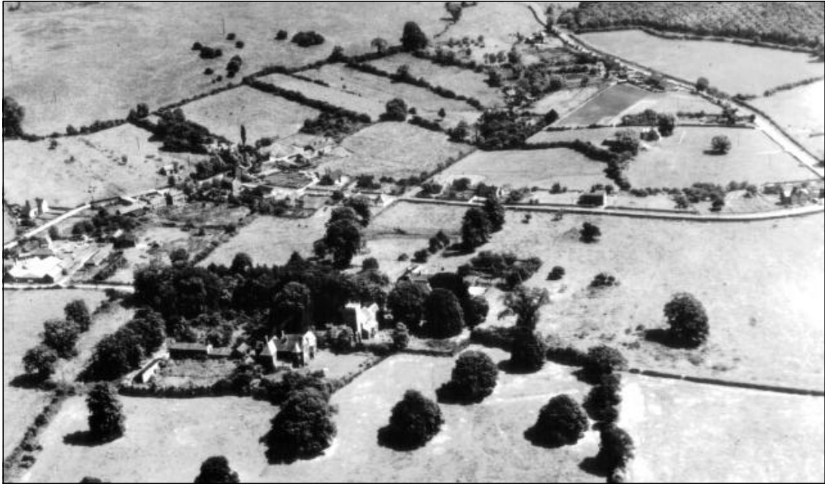
Aerial Photograph of Claxby in 1964

The provision of housing did not appear to have been a problem until the Second World War. Claxby had reduced in size when the mine closed so there were probably some houses unoccupied from time to time. The census of 1891 showed that only five of the twenty houses in the Terrace were occupied. There were also references in the Market Rasen Mail to houses in Claxby being occupied by people