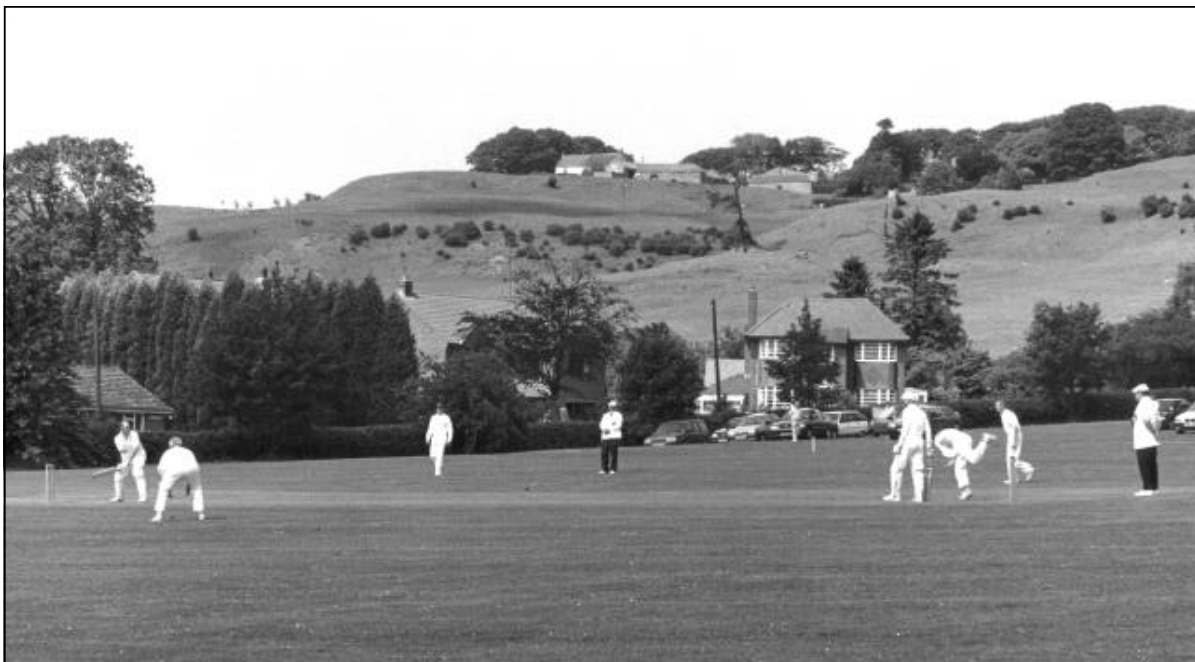
Cricket on Claxby Playing Field

Sport also formed a large part of leisure activity for many in the village. The first reference in the Market Rasen Mail was in May 1906 when a fund raising dance was held to buy